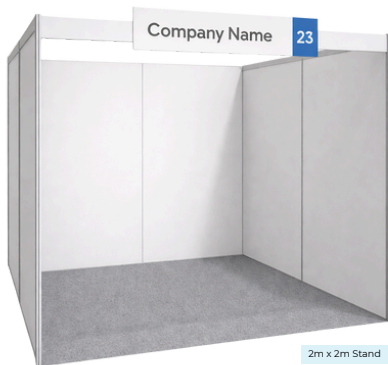
2m x 2m Stand